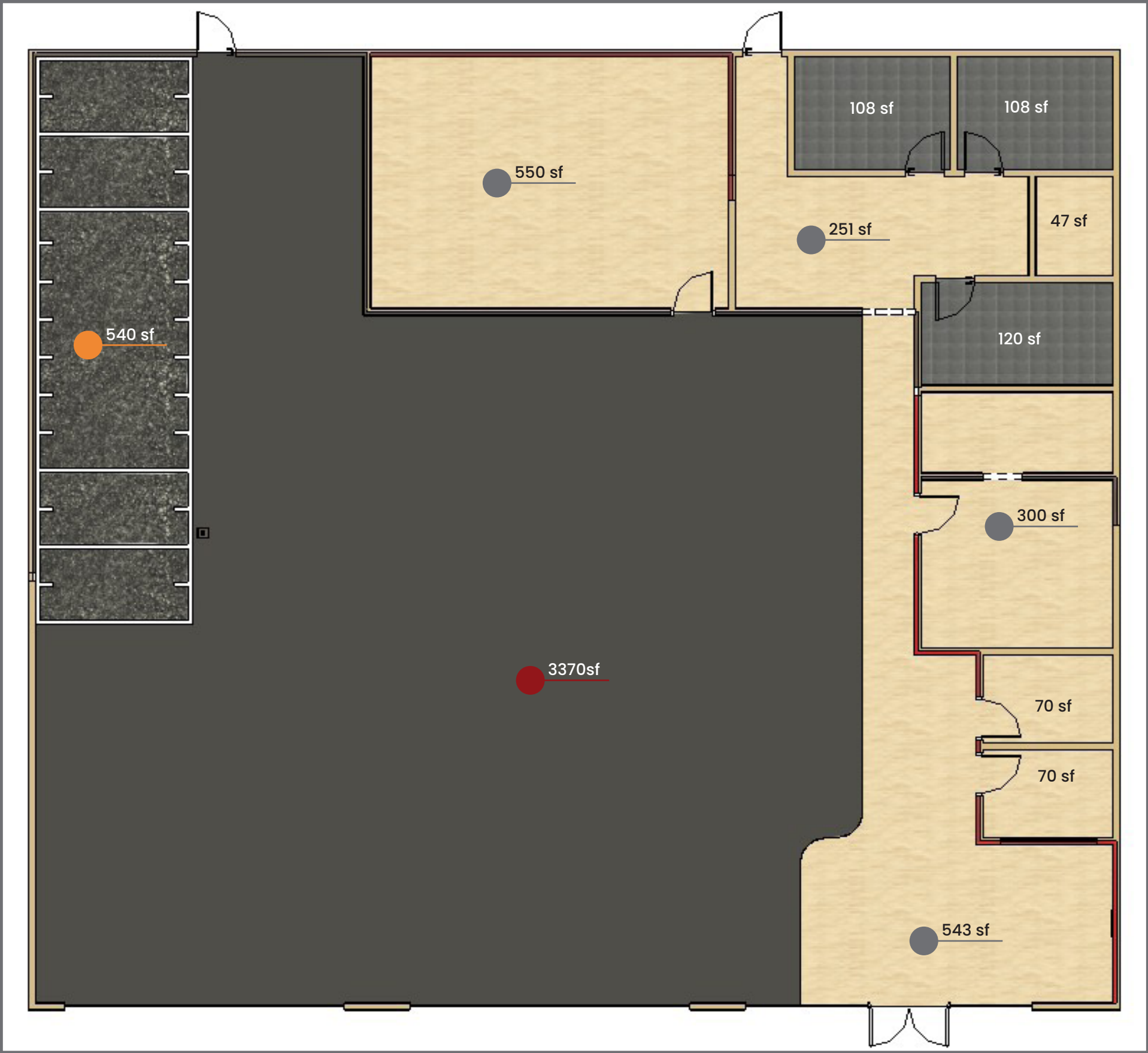
Flooring square footage represented is an estimate and should be confirmed by owners of the facility, contractor, or other agents prior to final ordering of material.

Rough SF: 6,203 Iowa Colony, TX 2D Material Plan March 30, 2026